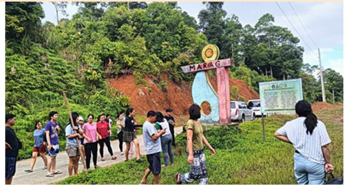
Learning visit of students at Marag Valley, one of the historical sites marked by MPSPC

Through the project Mapping and Marking of Historical Sites, MPSPC is instrumental in disseminating historical information to the whole of the Cordillera Administrative Region by installing historical markers at sites where significant events on the struggle for Cordillera Autonomy have happened. These markers were placed in areas that are easily accessed by local and foreign tourists thus, educating individuals about the historical importance of the places they are visiting.