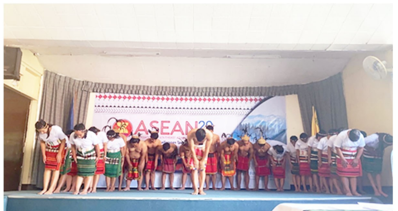
55th ASEAN Month Celebration Regional Chanting and Singing Contest