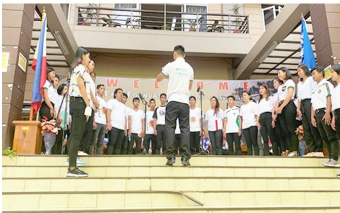
114th Founding Anniversary & 18th Am-among Festival