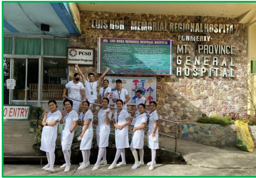
Student nurses during their affiliation at the Luis Hora Regional Memorial Hospital

Mental Health Awareness: The Office of Guidance and Counseling conducted a series of Mental Health Awareness programs where qualified personnel educated students about mental health concepts and promoted over-all well-being. This initiative fosters mental health awareness in line with SDG 3.